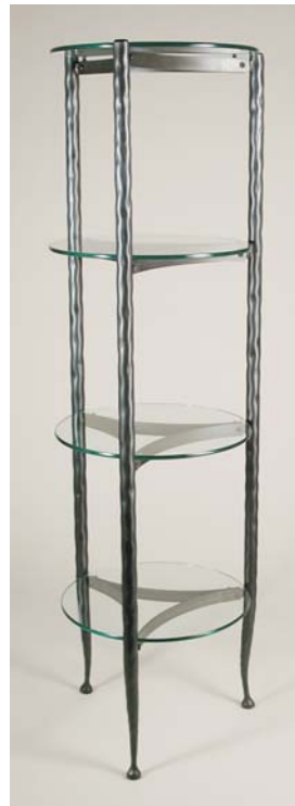
Pan Etagere SH414 18" x 18" x 64" high 14 7/8" between shelves