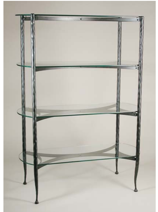
Pan Shelf SH412 20" x 46" x 64" high 14 7/8" between shelves