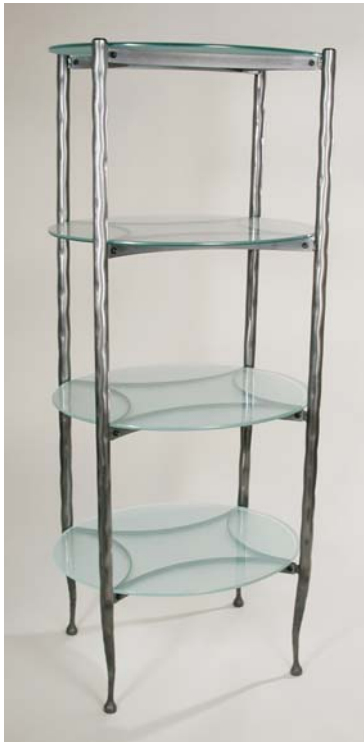
Oval Pan Shelf SH422 22" x 27" x 64" high 14 7/8" between shelves