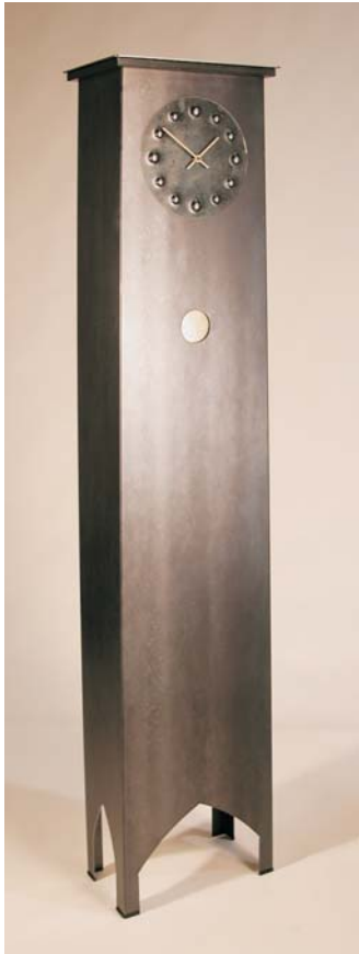
Grandfather Bungalow Clock CL125 - 15" x 8" x 69.5" high

Each clock has a polyurethane finish, has AA Quarts Movement, and the wall clocks come with their own wall-hanging bracket.