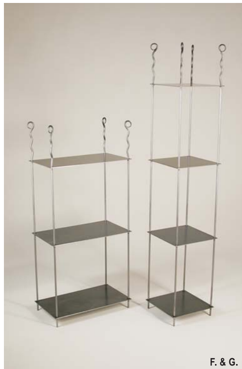
F. & G.