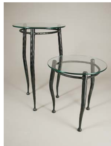
Pan Occasional Table