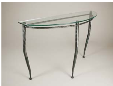
Pan Console Table T1094