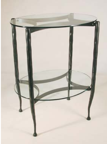
Oval Pan Stand SH427 22" x 27" x 36" high 20" between shelves