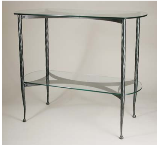
Pan Bar Table SH416 23" x 48" x 36" high 20 3/8" between shelves