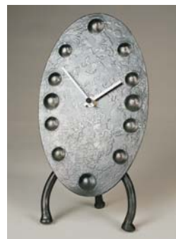
Oval Clock CL123 3.5" d x 5" w x 9.75" h