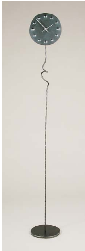
Bean Pole Clock CL122 9" x 9" x 64.5" high