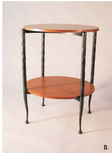
B. Vera Stand SH426 22" x 27" x 36" high 20" between shelves