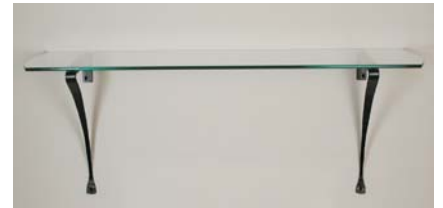
Pan Wall Shelf SH418 10" x 48" x 10.5" tall Comes with 1/4" thick tempered safety glass