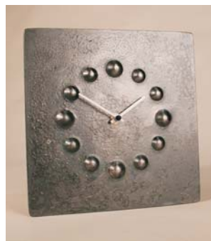
Moderne Clock CL127 8" x 8" square