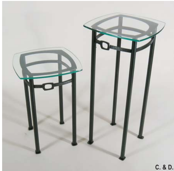
C. & D.