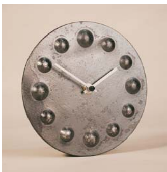
Moon Clock CL126 6" x 6" round