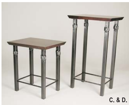
C. & D.