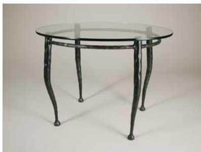
Pan Side Table T1092