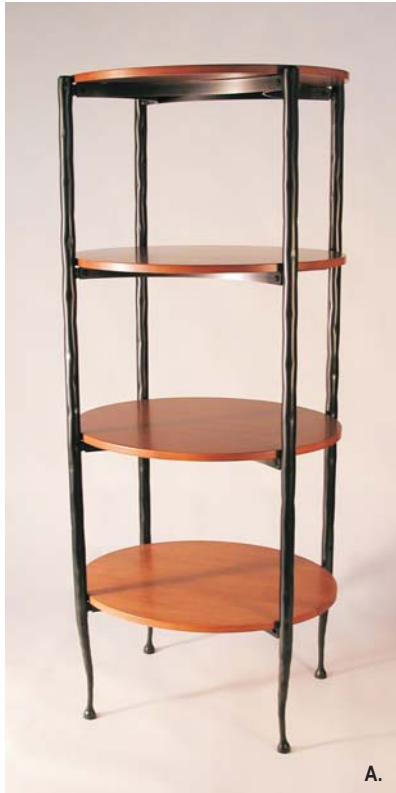
A. Vera Shelf SH425 22" x 27" x 64" high 14 1/2" between shelves

The solid 3/4" thick, ecologically sustainable, plantation-raised hardwood tops are a natural Cherry color and coated with a durable polyurethane specially created for restaurant use.