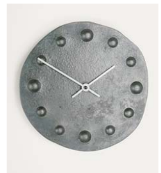
Lunar Clock CL121 9" x 9" round