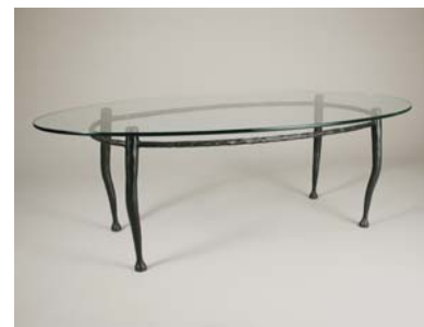
Pan Coffee Table T1093